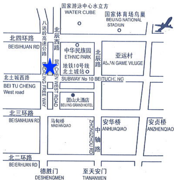
Figure 3. Card for taxi driver. The blue star indicates the IGGCAS.

Please send me to the Beijing Grand Hotel, Thank you.