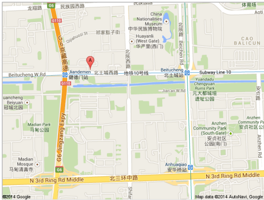
Figure 1. Google Map showing location of IGGCAS (marked as bubble "A")